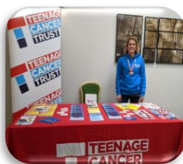
Teenage Cancer Trust