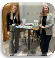
The Ella Dawson Foundation