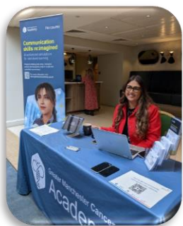
Greater Manchester Cancer Alliance