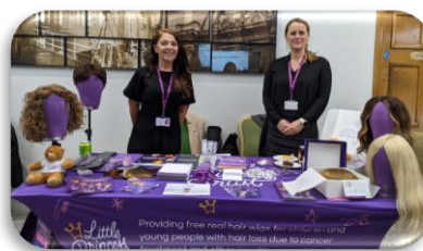
The Little Princess Trust