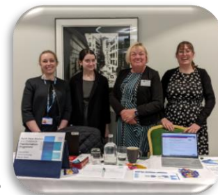
North West NHSE Transformation Team