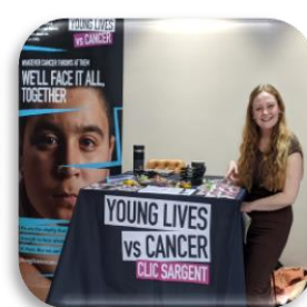
Young Lives vs Cancer