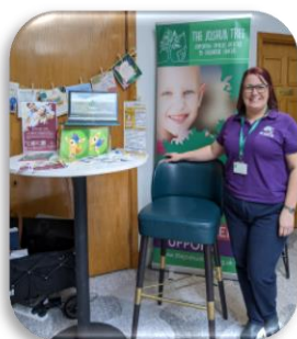
The Joshua Tree