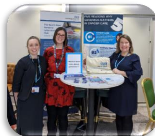
North West Genomics Medicine Service Alliance & North West Genomics Laboratory Hub