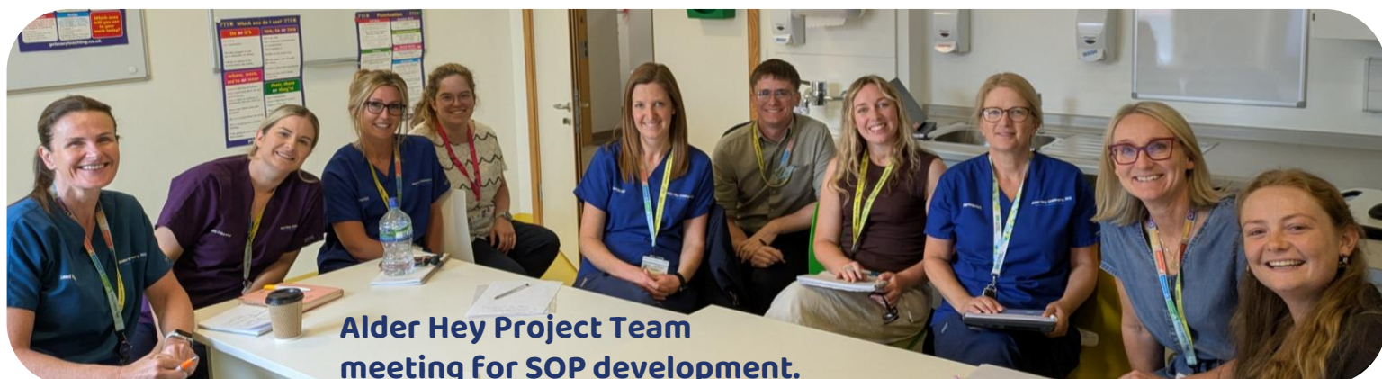
Alder Hey Project Team meeting for SOP development.